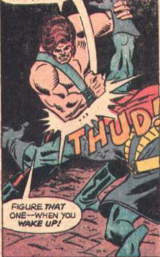
FIGURE THAT ONE--WHEN YOU WAKE UP!

--BUT I'M FROM A MUCH MORE ADVANCED TIME THAN YOURS!